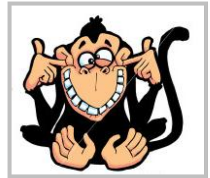
Hear No Evil