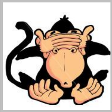
See No Evil