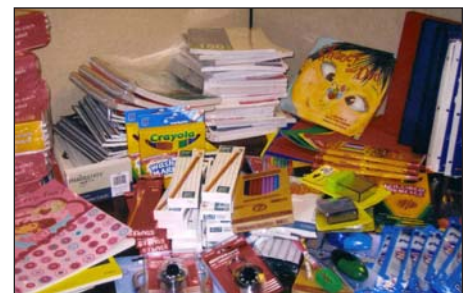
Above are just some of the donations the Downtown Center Staff Council donated to the Orlando Rescue Mission.

The school supply drive is an annual event for the Downtown Center.